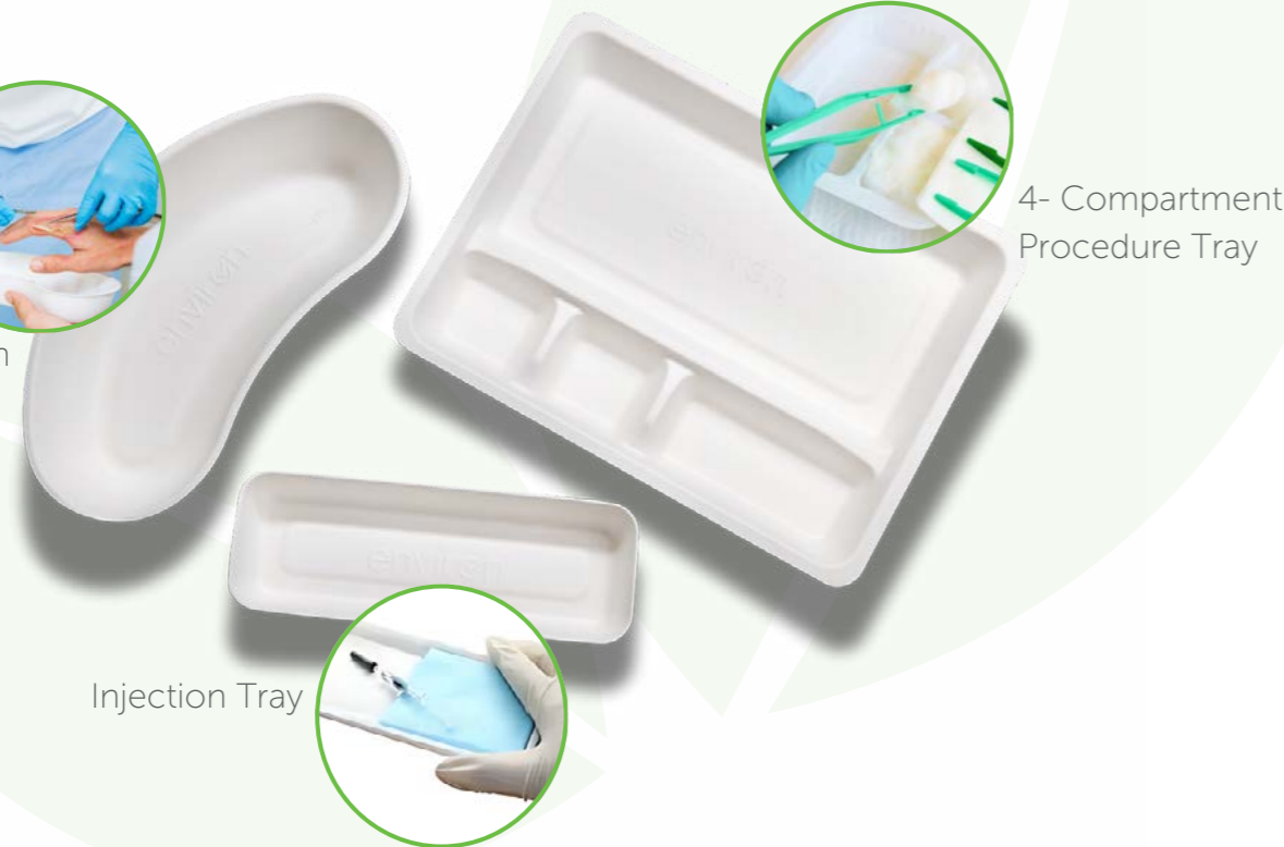
4- Compartment Procedure Tray